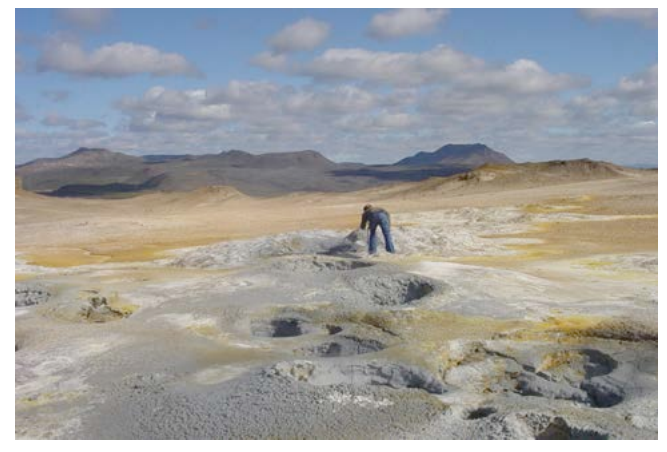
Figure 4: Recording volcanic bubbling clay pot

the 1950s in Paris. Schaeffer and others recorded sounds on tape, catalogued them in a complex system, and made systematic use of them in their compositions. In the 1980s digital samplers were introduced where people could record a sound and manipulate it digitally and control with digital interfaces. Together with these early explorations of the found sound and ever more sophisticated technology, the idea of using real world sounds in music became commonly accepted. But it took time for this to infiltrate into popular culture: just consider in this context the media attention in 1981 of the release of My Life in the Bush of Ghosts by Brian Eno and David Byrne or in 1998 when Matthew Herbert released his Around the House album (made of pure domestic sounds).