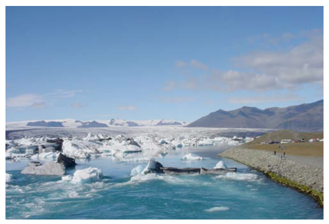
Figure 3: Ice and river sounds from the south of Iceland

In Western musical culture, the old mind/body dualism exhibits itself in the distinction between music as a score on the one hand and music as a performance through embodied and situated activity on the other. We have the intellectual system of notation and musical theory - the cerebral activity composing on paper versus the embodied activity of playing an instrument, where style is incorporated into the body through practice. This dualism has resulted in the kitschification of two roles: of the composer as a genius and the performer as virtuoso. The latter part of the 20<sup>th</sup> century saw an increasing focus on sound itself, the rejection of the institutional middle class music education, and emphasis on improvisation in musical performances. SSBD transcends the dualism mentioned above with its blurry conceptualization of authorship and performance: the focus is on sound and texture that is generated in real-time by interpreting instructions that are created partly by humans and partly by the machine.