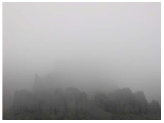
Figure 7: The fog silences the animals but not the water streams

Works of generative art can be written in any environment and distributed by any means. A programming language like C has an almost unlimited potential and portability. However, the biggest question for the artist is: what is the most efficient, quick and portable environment to make the work in? Higher level programming languages are better for development, but at the cost of less expressivity. Director and Flash are commercial coding and multi-media environments that have been popular with artists for years, but open source and cross platform environments such as Processing/Java, Python and Ruby are becoming ever more popular. In the world of sound, Pure Data, SuperCollider, ChucK and CSound are amongst the most expressive environments for generative composition and so is Max/MSP although that is closed source and commercial software.