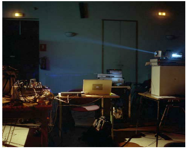
Figure 2: SSBD performed at the Ertz festival in Basque Country.

interfaces to the same sound engine or communicate through code in a networked performance.<sup>2</sup> What is of main interest here though is the power of the computer to calculate music in realtime, which essentially means that the computer is not just a player that plays a recording of some performance, but an active interpreter that interprets the score (the program) written by the composers (the programmers).